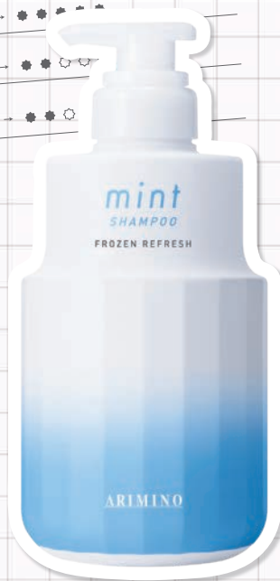
SHAMPOO FROZEN REFRESH