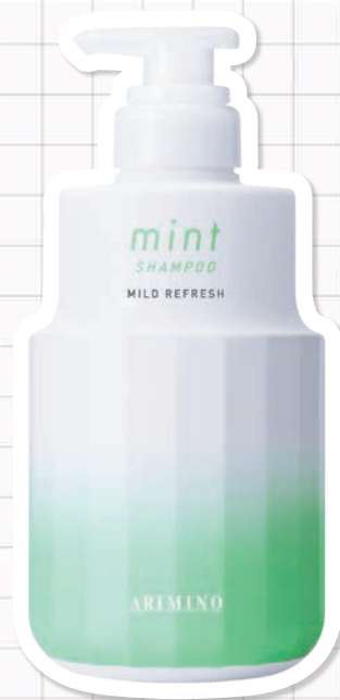
SHAMPOO MILD REFRESH