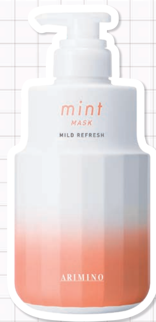
MASK MILD REFRESH