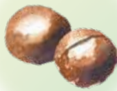
Soap nut extract (moisture retention)

A natural cleaning agent cultivated at organic farms in southern India, with the ability to remove odors from the scalp. It can retain moisture and has a gentle sensation when used for washing.