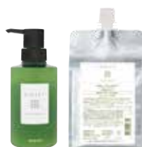
QUILT TREATMENT 270g / 1000g

※The ARIMINO standard refill bottle which can be used with the above products(1000mL/1000g) is sold separately.