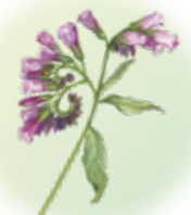
Comfrey leaf extract (moisture retention)

A naturally-derived herb which can help to have a healthy scalp and hair.