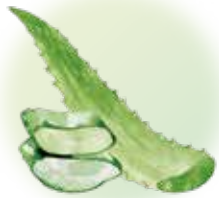
Aloe vera leaf extract (moisture retention)

※Images are for illustrative purposes only