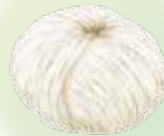
Wool keratin (hair repair)

Has the same amino acid balance as hair, to give bounce and resilience to damaged hair. It is sustainably produced using waste wool.