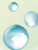
Proteoglycan (moisture retention)

※Hydroxypropyltrimonium hydrolyzed keratin (wool)