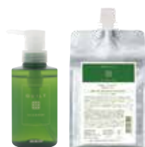
QUILT SHAMPOO 270mL / 1000mL

※1 Made with environmentally-friendly ingredients, containers, and manufacturing methods. ※2 Manufactured without heating plant extracts and other ingredients.