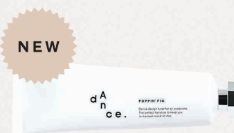
POPPIN' FIG. Balm milk

Balm milk for light and bouncy style that reminds you of popping dance, getting the rhythm by body popping. It blends in well with dry hair and brings pieciness and glossy style to you. Ideal for unruly hair and curls, as it holds to define curls. Non-sticky balm makes you feel like using it every day.