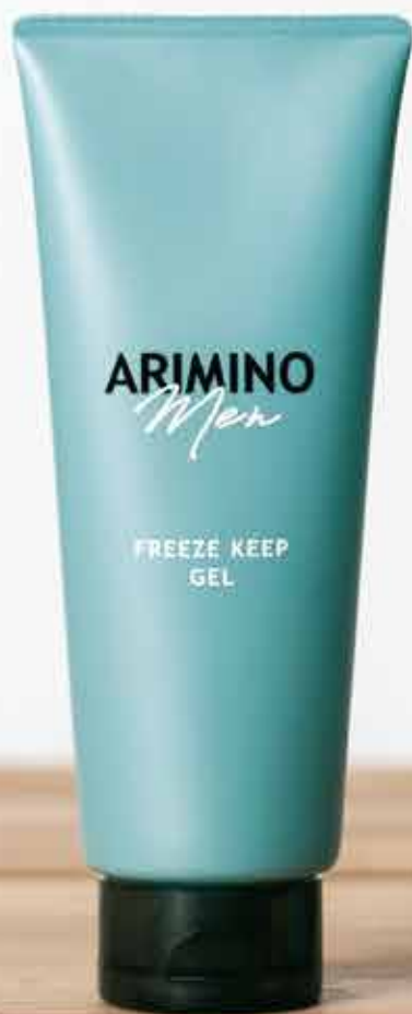
FREEZE KEEP GEL